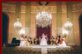
Concert at Palais Auersperg, Vienna