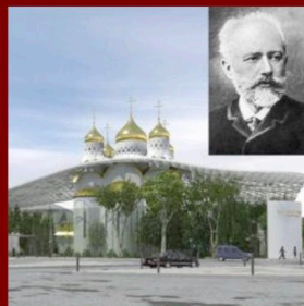
Concert at Russian Cultural & Spiritual Center, Paris