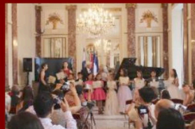
Concert at Le Centre de Russie pour la science et la culture a Paris