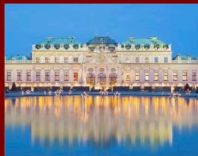
Vienna, Austria June 23 - 30, 2019