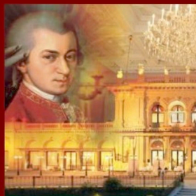
Concert at Amadeus School, Vienna