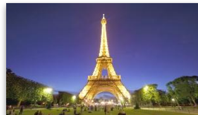
Paris, July 8 - 15, 2018