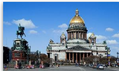
St. Petersburg, July 1 - 8, 2018