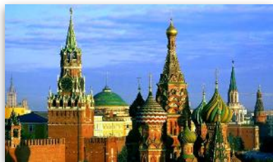
Moscow, June 24 - July 1, 2018