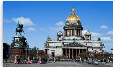
St. Petersburg, July 1 - 8, 2018