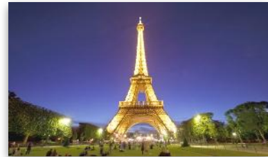
Paris, July 8 - 15, 2018